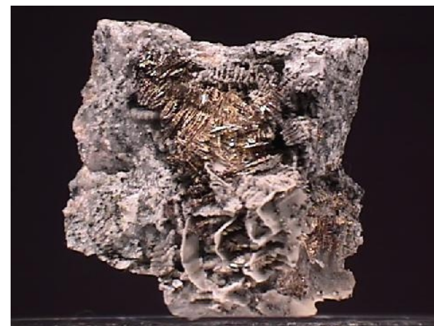
Information Circular 1998-10