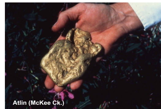
Atlin (McKee Ck.)