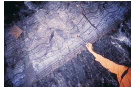
Banded sulphide ore (Sullivan)