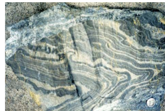
Banded sulphide ore (Myra Falls)