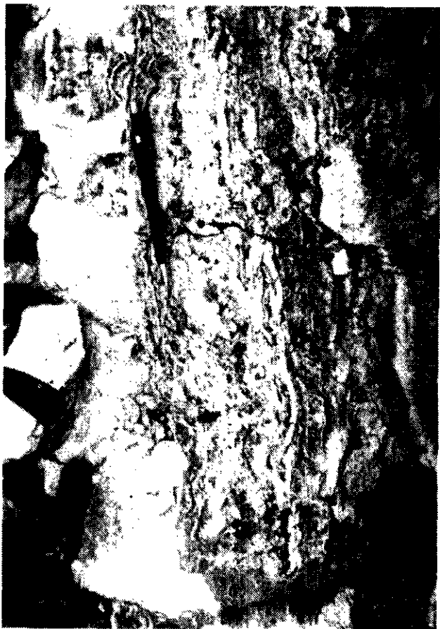
Plate 2-1-4. Dusty Mac property. Multiple banding in quartz vein in laharic breccia.

At the south end of Skaha Lake epithermal mineralization at the Dusty Mac mine occurs in quartz-vein breccia in laharic deposits of the Eocene White Lake Formation (Church, 1969, 1973). The geology of the area is dominated by a northwest-trending fault system and dissected locally by numerous normal and reverse faults. Fracture-controlled veins are commonly banded (Plate 2-1-4), or exhibit cockscomb quartz intergrowths. The deposit was mined