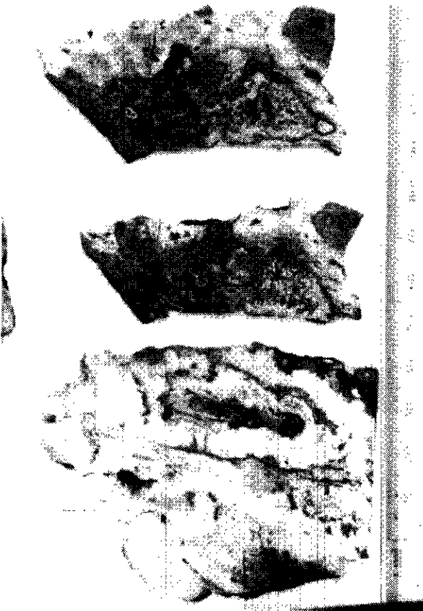
Plate 2-1-2. Brett property. Banded, vuggy and brecciated quartz veins. Wallrock material is silicified and clay (illite) altered; Trench No. 1, Main Shear Zone.

rocks of the Nicola and Slocan groups, between Equis Creek and the Salmon River. The veins are subparallel to host-rock foliation and are mainly gold-rich with low silver values. A minority, however, are silver-rich, gold-poor veins that contain galena and sphalerite. Alteration is variable and generally not well defined over large areas. Chlorite, limonitic carbonate, sericite and weak graphitic alteration are the most common.