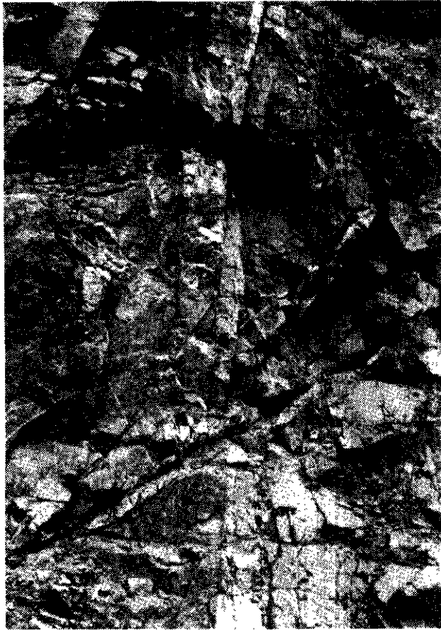
Plate 2-1-8. Dankoc mine. Pegmatite dykes cutting Kruger syenite (mJg) near adit portal.

camp, reflects the historical exploration bias toward pre-Tertiary rocks.