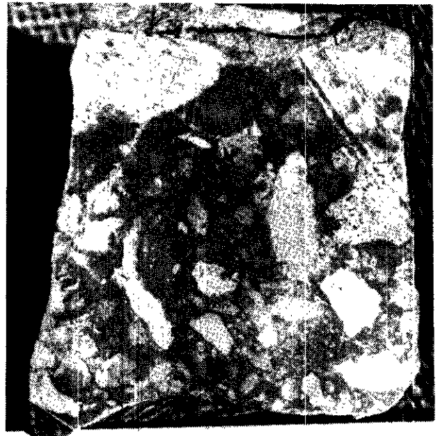
Plate 2-1-3. Brett property. Silicified and pyritized breccia, Gossan Zone.

The White Elephant property which was exploited briefly in the 1920s and 1930s, is several kilometres south of Whiteman Creek. Precious metals occur in fractured and faulted