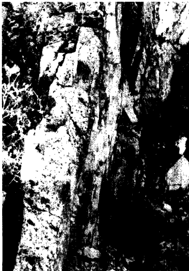
Plate 2-1-7. Standard property. Steeply dipping quartz vein enclosed in granodiorite (Jog) adjacent to adit portal.

A similar setting exists at Orofino Mountain where the host rocks are greenschist metasedimentary rocks of the Upper Triassic Old Tom and Shoemaker groups, intruded by dioritic and gabbroic rocks. Northeast and northwest-trending quartz veins carry gold and silver associated with polymetallic sulphides and chlorite-sericite alteration. The host strata and mineralization are cut by a number of northeast-oriented normal faults.