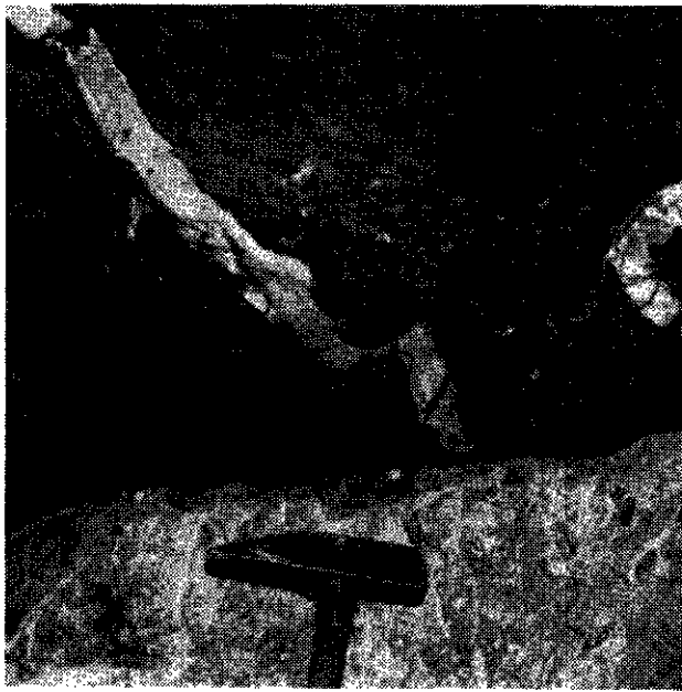
Plate 2-1-1. Imperial property. Deformed quartz vein and felsic dyke in schistose, chloritized metasedimentary rocks, which are truncated by lower grey breccia zone.