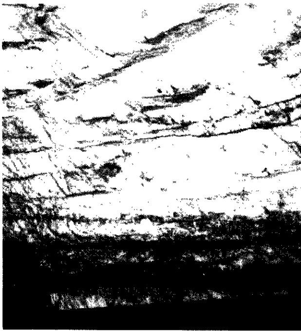
Plate 2-1-6. Fairview mine. Cleavage development in quartz vein, oriented parallel to S_1 foliation in wallrocks. Crossfracturing is subperpendicular to cleavage; No. 6 level.