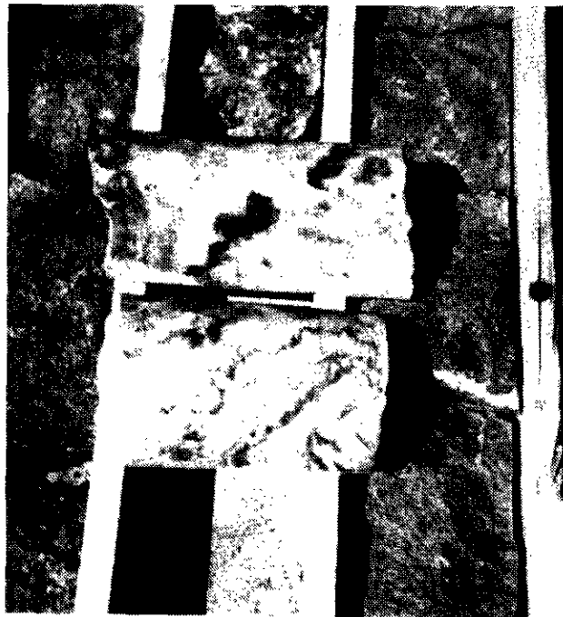
Plate 2-1-5. Vault property. Banded gold-bearing quartz vein in tuffaceous trachyandesite. Core is 4.5 cm in diameter.

At the Fairview mine, deformed gold-silver veins (Plate 2-1-6) occur in refolded and faulted Kobau metaquartzites of Carboniferous to Permian age (Okulitch, 1969, 1973) that are wedged between Oliver granite and the Fairview granodiorite. Renewed exploration has been hampered by the structural complexities of early polyphase folding and superimposed normal and reverse faulting (Meyers, 1988b). Veins are typically mesothermal, with precious metals associated with iron, lead, zinc and copper sulphides. The Stemwinder and Morning Star mines lie immediately southeast of the Fairview property and are interpreted to be part of the same quartz lode system cutting the Kobau stratigraphy. Operations in the Fairview camp were intermittent between 1895 and 1961, with total production amounting to 473 000 tonnes of ore which yielded 1944 kilograms of gold and 23 021 kilograms of silver.