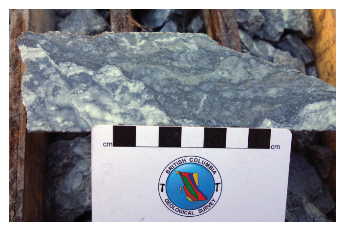
Fig. 3. Brecciated quartz veins and sulphides from a drill sample grading 16 g/t Au. Eagle zone, Reliance project, Endurance Gold Corporation.

included peripheral targets off the main mineralized structure, a 4 km trend including the South zone, FMN and Franz targets. The company discovered a gold-bearing zone 1.2 km northeast of the South zone resource area. Highlight results at the FMN zone included 23.03 m grading 37.24 g/t Au and 209.52 g/t Ag, and 14.96 m grading 5.96 g/t Au and 343.57 g/t Ag. Detailed mapping at a 1:100 scale of the Franz zone was carried out to guide surface sampling and complement earlier drilling. The Shovelnose project incudes multiple low-sulphidation epithermal precious metals prospects and targets in the Spences Bridge gold belt.