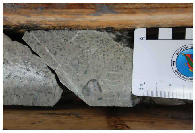
Fig. 2. Silicified (±sericitized) Nicola Group crystal-lithic tuff with disseminated pyrite. This type of rock has returned significant gold values in Lightning zone intersections. Tower Resources Ltd., Rabbit North project.

Tower Resources Ltd. identified the source of a gold grain anomaly in till and reported an initial drill intersection of 95.0 m grading 1.40 g/t Au including an interval of 19.2 m with 4.21 g/t Au in this new discovery, referred to as the 'Lightning zone' (Fig. 2). Follow up in 2022 included additional drilling and till sampling that indicated another gold dispersal train, called the Central Train, 400 m west of the Lightning zone. Seventeen new samples yielded between 40 to 452 gold grains per sample leading to a target under young (possibly Miocene) basalts. The Rabbit North project also hosts alkalic porphyry Cu-Au targets.