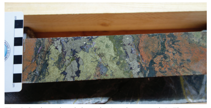
Fig. 4. Semi-massive chalcopyrite (+pyrite+magnetite). The orange staining is probably hematitic rather than from potassic alteration. The green interpreted as propylitic alteration (mainly epidote). Kodiak Copper Corp., MPD project.

MPD is a consolidation of the Man, Prime, and Dillard alkalic porphyry Cu-Au targets, which had historically been explored to about 200 m depth. The Gate zone, a 2019 discovery, indicated that significant Cu-Au mineralization extended to greater depths (Fig. 4).