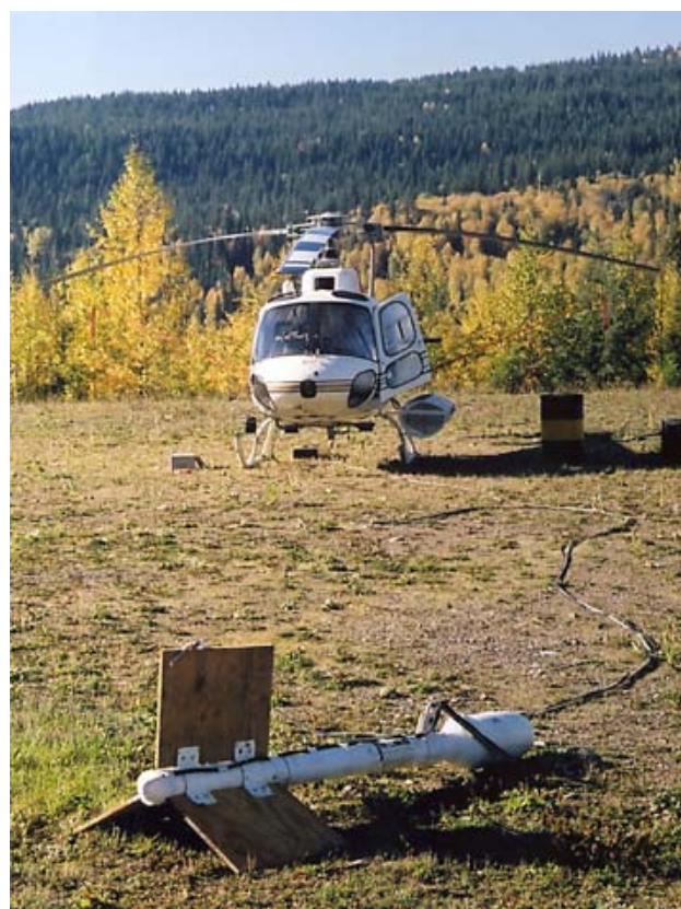
Photo 1. Fugro Airborne Surveys helicopter and magnetometer bird in the Likely area, September 2003.

Final results will be presented in GSC and BCGS Open File formats in Spring 2004. The Open Files will consist of digital data (Geosoft compatible line and