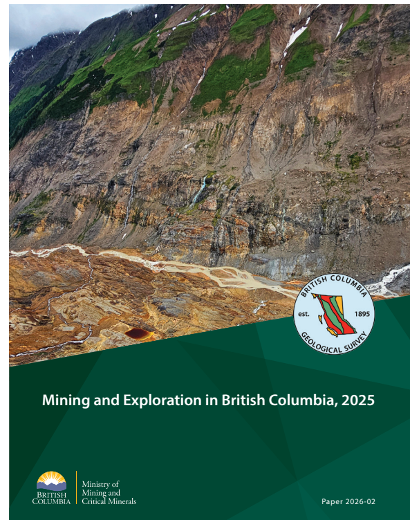
Mining and Exploration in British Columbia volume, British Columbia Geological Survey Paper 2026-02