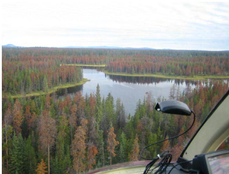
Figure 3. Typical lake sample site located in southeastern Nechako Basin, central BC. The extent of mountain pine beetle kill can be seen by the number of orange to brown trees.

sediment and water samples were routinely collected in each analytical block of 20 samples.