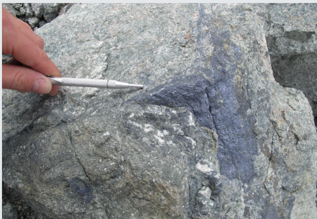
MoS 2 mineralization at Endako's Denak West Pit

The British Columbia Geological Survey's MINFILE database lists 1,381 molybdenum-bearing occurrences, 460 of which list molybdenum as the primary commodity. Mo and Cu-Mo porphyries are the main deposit types. The developed Mo porphyries in B.C. are classified as low-fluorine type, distinct from the high-fluorine climax type known in the western US. Most are low-grade bulk tonnage targets, but some deposits with high-grade cores are potentially amenable to underground mining, such as the MAX (280 Kt @ 1.17% Mo) and Davidson (6.7 Mt @ 0.36% Mo). Porphyry Cu-Mo deposits, in particular Highland Valley Copper, account for a large proportion of B.C. molybdenum production, resources, and reserves as a by-product of copper production.