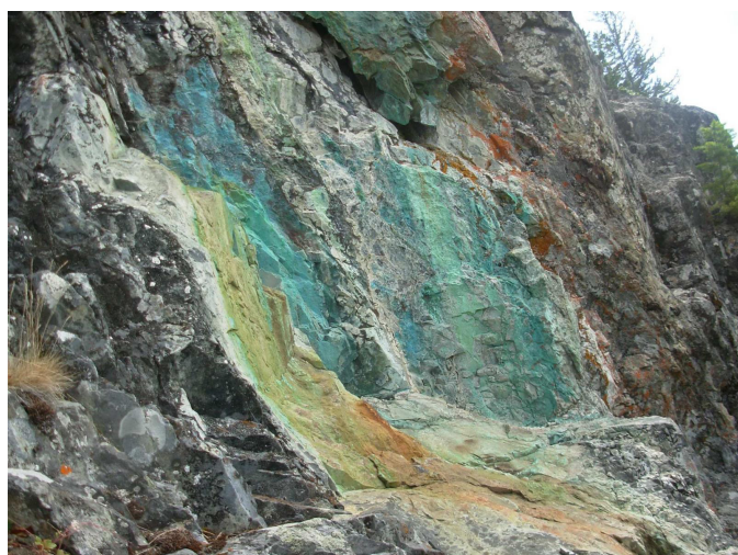
Fig. 6. Bluff copper project. Intense malachite staining at a possible porphyry in a geological setting broadly similar to the Ike project (Image courtesy of Tchaikazan Resources Inc.).

deposits of diverse origins (e.g., mantos, sedimentary exhalative deposits; and volcanogenic massive sulphide deposits). South Central region has a history of successful exploration, development and mining of polymetallic deposits. However, in the past few years, only a few projects (e.g., TL ; Redhill ) have targeted this deposit type.