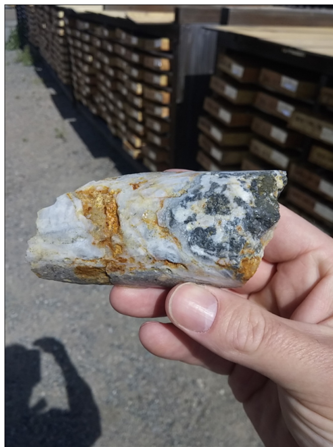
Fig. 4. Shovelnose gold project. Westhaven Ventures Inc. explored low-sulphidation epithermal gold systems south of Merritt. This sample had ~16 grams per tonne gold and ~30 grams per tonne silver (Image courtesy of Westhaven Ventures Inc.).

Westhaven Ventures Inc. drilled the Shovelnose property, 30 kilometres south of Merritt and southeast of Prospect Valley. Shovelnose (like Prospect Valley) is described as a low-sulphidation, epithermal gold system within the Spences Bridge Gold belt. An initial round of drilling (5 holes; ~1,150 metres) started in May to test the Mik, Tower and Alpine zones. The Mik and Tower zones have been drilled previously, but the Alpine zone was discovered in 2015 by an induced polarization survey. One hole in the Alpine zone intersected 0.27 g/t Au over ~120 metres, starting at bedrock. Higher grades (up to ~17 g/t Au) over narrow widths (0.5 metres) were also found (Fig. 4). Follow-up drilling in November (4 holes; 725 metres) attempted to extend favourable results from the Alpine zone. Analyses are pending. Drilling in 2016 has expanded the Tower and Alpine zones which remain open in all directions.