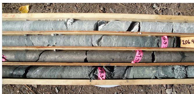
Fig. 7. Redhill volcanogenic massive sulphide project. Massive sulphide layer (between pink flagging) at the Alpha zone, 15 kilometres south of Cache Creek (Image courtesy of Troymet Exploration Corp.).

The South Central region has a history of successful exploration, development and mining of skarn deposits. In the