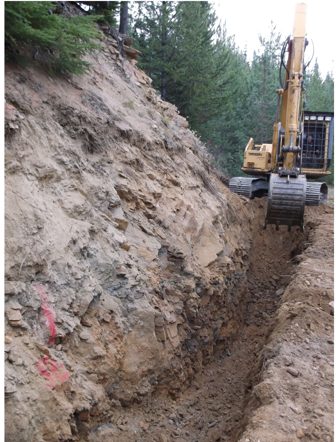
Fig. 8. BC Sugar graphite project. Lithium Corporation is studying results of 2015 trenching (shown here). Graphite occurs as thin seams in metasedimentary rock of the Shuswap metamorphic complex, east of Mabel Lake.

Homegold Resources Ltd. has a permit to sample 500 tonnes of gypsum at its Snapper project, 15 kilometres west of Merritt.