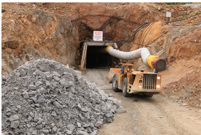
Fig. 3. Bonaparte gold project. WestKam Gold Corp. advanced its decline towards the Grey Jay/Crow vein system to collect a 10,000 tonne bulk sample.

related to the Main zone. Precious metal mineralization occurs as native gold, electrum and argentite associated with multiphase silica veins, stockworks and breccias in Kamloops Group (Eocene) volcanic and volcanoclastic rocks. Ximen also started grassroots exploration for silver at the Treasure Mountain North project adjacent to the Treasure Mountain silver-lead-zinc mine south of Merritt.