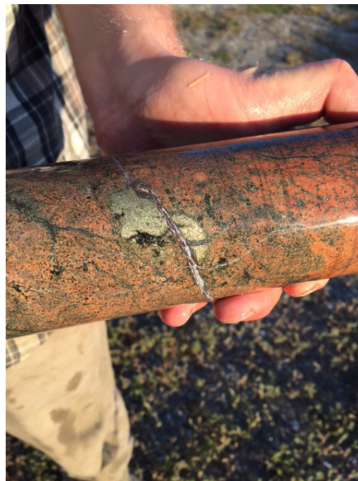
Fig. 5. Copper King copper-gold project, 20 kilometres west of Kamloops. Offset sulphide lens and quartz veinlet in brecciated Cherry Creek monzonite, a phase of the Iron Mask batholith.

Kaizen Discovery Inc. acquired the Aspen Grove copper-gold project in 2013 and commenced drilling in 2014. The project is a 60:40 joint venture between Kaizen and ITOCHU Corporation. Claims at Aspen Grove include a number of known mineral occurrences (e.g., Zig-Nor, Thalia; Boss-Thor; Par; Ketchan Lake; Coke). The current drilling has focused on Par and Ketchan Lake . Three seasons of drilling at Ketchan Lake have confirmed the size of the porphyry intrusive. Mineralization spans a zone approximately 500 metres wide and 1,800 metres long. Drilling in 2016 (8 holes; ~4,000 m)