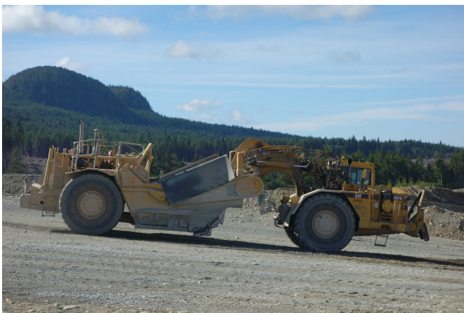
Fig. 2. A scraper at the Orca quarry.

Polaris Materials Corporation operates the Orca quarry near Port McNeill, which produces sand and gravel mainly for export (Fig. 2). Polaris Materials anticipates full-year 2017 sales of