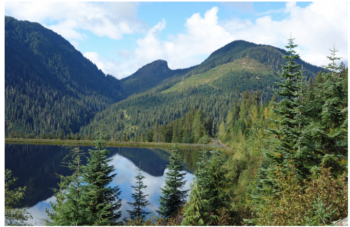
Fig. 5. View of the Carolin mine area from the tailings pond. The main resource is in the logged area.

New Carolin has surrounding tenures covering much of the Coquihalla gold belt, a north-northwest trending series of gold