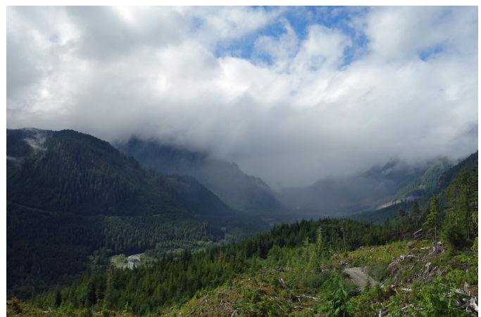
Fig. 4. The Zeballos River valley looking south west. The historic mining camp spanned the river, with most mines southeast of the river (left of frame).