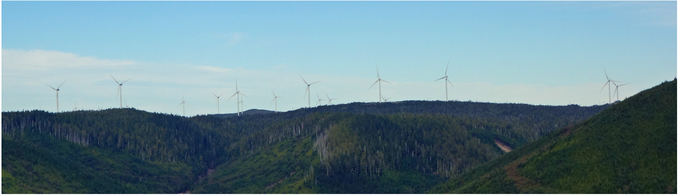
Fig. 6. Cape Scott wind farm looking north from North Island porphyry project.

southeastern extension of the Hushamu deposit, testing an area in the Hushamu deposit previously considered occupied by late or post-mineral breccia and barren, and testing for deep mineralization at Red Dog. Mineralization at Hushamu does appear to be open to the southeast and north and the infill drilling encountered mineralization above cut off. The hole at Red Dog was lost before reaching target depth but did encounter porphyry style alteration and increasing mineralization at depth.