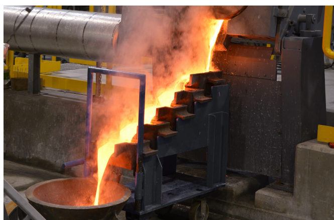
Fig. 2. Gold pour, Brucejack mine.

Total mineral reserves and resources for the project are based on the Valley of the Kings (VOK) and West zones. In 2016,