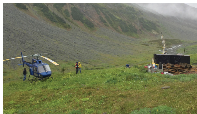
Fig. 3. Drill setup, Forest Kerr project.

In 2017, Aben carried out a nine hole, 2445 m diamond drilling program at the Forest Kerr project (Fig. 3). Highlight results from the newly discovery Boundary North zone included 1.2 g/t Au, 1.8 g/t Ag and 0.21% Cu over 122 m that includes 10.9 g/t Au, 14.6 g/t Ag and 1.5% Cu over 12 m with a high grade core of 21.5 g/t Au, 28.5 g/t Ag and 3.1% Cu over 6 m.