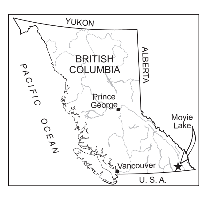
Figure 1. Index map showing the location of the MTS structures at Moyie Lake.

At Moyie Lake, the MTS are best observed on the weathered surface, where they tend to weather recessively relative to the host carbonates. The MTS develop a whitish-grey weathered surface that contrasts with the tan coloured weathering of the host rocks (Photo 1). Both the MTS and the host carbonates have a similar medium grey colour on fresh surfaces. The dominant fill in the MTS are carbonates, which are generally authigenic and rarely clastic in origin (James et al. , 1998). Authigenic pyrite and feldspar are found as accessory minerals within the MTS, attesting to fluid flow along these structures after