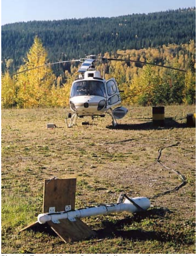
Photo 1. Fugro Airborne Surveys helicopter and magnetometer bird in the Likely area, September 2003.

Final results will be presented in GSC and BCGS Open File formats in Spring 2004. The Open Files will consist of digital data (Geosoft compatible line and