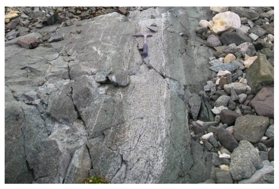
Figure 6. Typical compositional layering of plagioclase-rich (lighter) bands and pyroxenerich (darker) bands within the layered mafic intrusion on Chatsquot Mountain. Rock hammer for scale

One of the most abundant plutonic suites in the southern Whitesail Lake map area is a texturally and compositionally complex assemblage of fine to mediumgrained, hornblende to biotite hornblende granodiorite, quartz diorite and tonalite that is primarily exposed in the