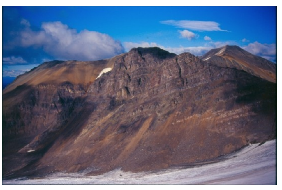
Figure 3. Thick succession of rhyolitic tuff, lapilli tuff, and associated volcaniclastic sedimentary rocks on the south end of Gable Mountain. Note abundant gossan associated with strata and associated structures.

In the western portion of the map area, the Monarch assemblage is exposed within a series of structural panels that are interpreted to represent an imbrication of several different stratigraphic-structural levels within a single volcanoplutonic arc assemblage (Fig. 4). From the lowest structural level upward, these panels include 1) a foliated to nonfoliated hornblende quartz diorite complex with metavolcanic xenoliths (10-20%) and abundant mafic dikes trending roughly east-west; 2) metavolcanic and metasedimentary screens (40-50%) within a 'matrix' of texturally and compositionally complex, locally magmatically foliated biotite-hornblende, pyroxenehornblende and hornblende diorite to quartz diorite (Fig. 5); 3) massive basalt, basaltic andesite and andesite flows, associated tuff-breccia and other fragmental rocks; and 4) volcaniclastic sedimentary strata and associated pyroclastic rocks. These structural panels are interpreted to