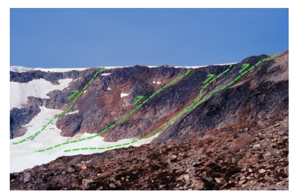
Figure 4. Imbricate thrust stack within Monarch assemblage and subjacent intrusive rocks, northeast of Chatsquot Mountain.

One of the structurally resistant structural panels is exposed on Chatsquot Mountain and the ridges immediately to the southeast and northwest of the main massif, which harbour spectacular exposures of a mineralized layered mafic intrusion (LMI; Fig. 2). Compositional banding in the LMI is typically