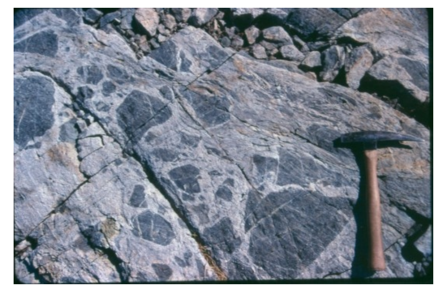
Figure 5. Clasts of metavolcanic rocks from the basal Monarch assemblage within hornblende diorite to quartz diorite. Intrusive rocks are presumed to be subvolcanic equivalent of Monarch assemblage. Rock hammer for scale.

Coola area (Haggart et al. , 2004). Fieldwork in the type area of the Monarch assemblage on the south side of the Monarch Icefield, south of the Bella Coola (NTS 093D) map area, during 2004 yielded fossils of Albian age, indicating that the Monarch assemblage most likely ranges from Valanginian to Albian in age. It is unclear if this age range encompasses a single stratigraphic succession or two (or more?) unconformity-bound successions. Fossils collected east of Price Peak have been submitted for identification, and U-Pb geochronology samples from rhyolitic lapilli tuff within the Monarch assemblage east of Chatsquot Peak are being analyzed.