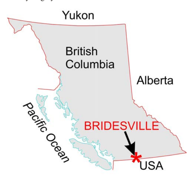
Figure 1. Location of the sedimentary-hosted Bridesville talc-carbonate deposit, southern BC.

The Bridesville talc-carbonate deposit lies within the Permian and/or Triassic Anarchist Group as defined by Little (1961), consisting of greenstone, quartzite, greywacke, limestone and locally paragneiss. Tempelman-Kluit (1989) also mapped the deposit area at a scale of 1:250 000, but a more detailed map is not currently available. The Bridesville talc-carbonate deposit may be stratigraphically related to the Rock Creek dolomite mine, also called Dolo (MINFILE 082ESE200; MINFILE, 2007), which is operated by Mighty White.