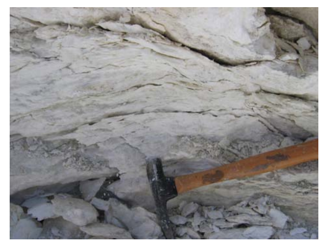
Figure 6. Strong preferential fabric and snow white colour characterizes talc-bearing zone, Bridesville, southern BC. Hammer for scale.