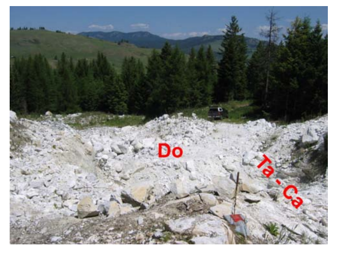
Figure 2. View of the excavation at Bridesville talc-carbonate deposit, southern BC; looking north (truck for scale). Abbreviations: Do, dolostone; Ta-Ca, talc-carbonate zone.