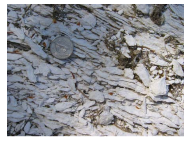
Figure 5. Weathered surface of the talc-bearing zone, Bridesville talc-carbonate deposit, southern BC, characterized by "flaky" texture (strong preferential planar fabric). Fivecent coin for scale.

The specifications of the main line of talc-rich products currently produced by Dynatec Corporation are still referred to as CANTAL but specifications evolved. The company's website (Dynatec Corporation, 2007a) indicates that in addition to its CANTAL<sup>™</sup> line of products, the company produces a dolomite-rich product under the trademark DYNAFIL. The product safety sheets for DYNAFIL<sup>™</sup> are currently identical to those of Dolfil<sup>™</sup>, as indicated by Canada Colors and Chemicals Limited's website (Canada