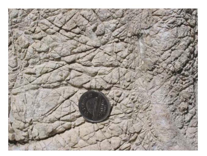
Figure 4. Weathered surface of dolostone showing nearly random fracturing, Bridesville talc-carbonate deposit, southern BC. Fracture pattern is enhanced by preferential weathering. Five-cent coin for scale.

steeply dipping greenstone unit and the surrounding marble is sharp and highly irregular. Similarly to the talc-bearing zone, the greenstone is also characterized by a strong schistose fabric; however, it consists largely of chlorite (>60%). Carbonates, dominantly calcite, account for less than 40% of this rock. Calcite is either intergrown with chlorite or forms veinlets. Quartz forms decimetre-scale, irregularly