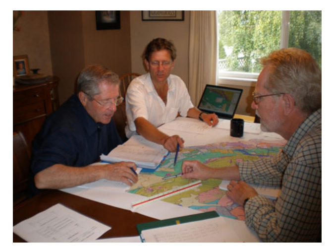
Figure 2: Experts discussing the mineral resource potential of a tract in the Atlin-Taku land-use planning area.

New staff members hired for the BCGS in late 2007 and in 2008 are