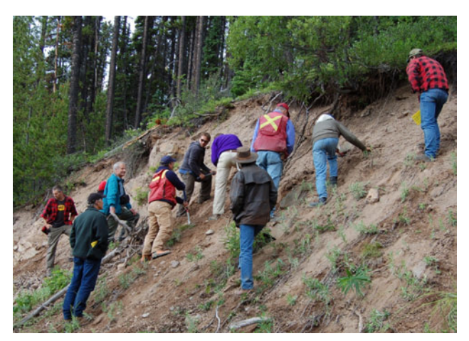
Figure 3. Field trip stop for the Smithers till prospecting workshop led by BCGS and GSC staff.

The MEMPR has partnered with universities and colleges since the 1940s to educate and inspire geoscience students and recent graduates. With its 23 permanent staff as professional mentors, the BCGS hired a total of 61 students and recent graduates over the past two years (Figure 4). These professionals in training have allowed us to deliver a